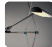
LED Flood light PS1050 Requires US-LINEAR